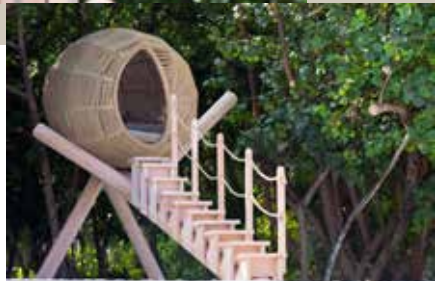
One Egg | One World Location: Vandhoo Beach