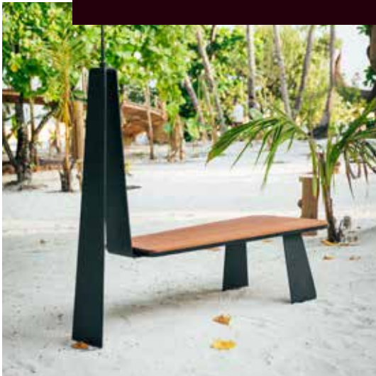
The Perch Location: In front of Bellinis

“The bench of JOALI is a perch, a point of rest and reflection for both Humans and Birds.”