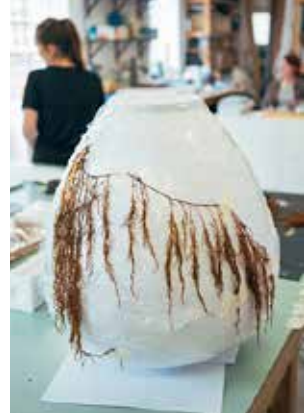
Silverware Vases & Botanical Tiles