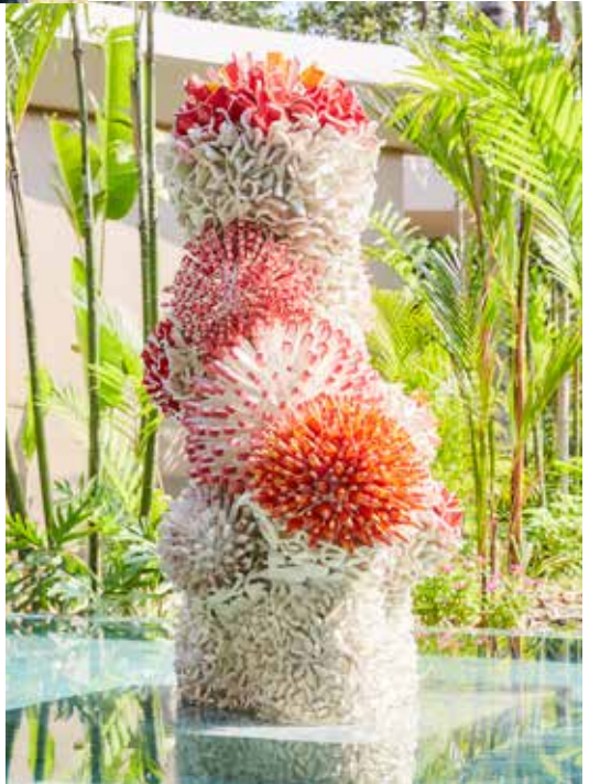
Maldives Vibes Location: Spa

“Maldives Vibes is inspired by the rich underwater world of Maldives. The intricate, delicate coral forms and the beautiful colours of the multitudinous organisms that call it home.”