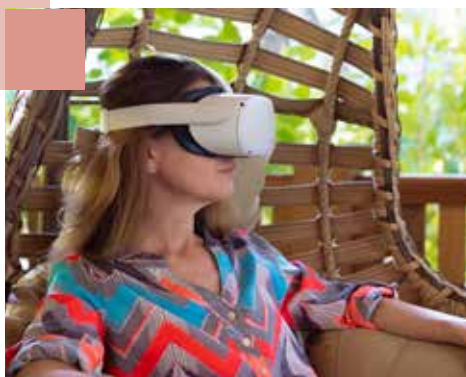
Day Dreams VR Location: Museum