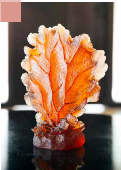
Glass Collection Location: In Villas