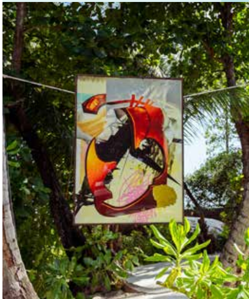
AR Contingencies Location: Art Studio Garden

This augmented reality installation opens a portal to a dimension between analogue and digital realms. Embedded in the actual space of the venue is a sound-immersive, walkable landscape, unfolding animated 3D objects with origins in painting and collage.