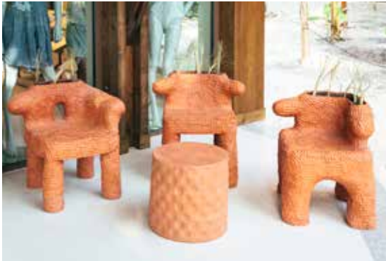
Terra Cotta Furniture Location: In front of the Maison De JOALI