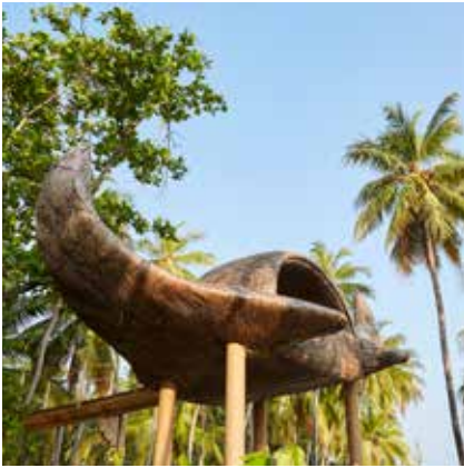
Manta Tree House – Bushra

Hefer employs traditional techniques, crafts and materials to create a functional space with modern relevance. Suspended among the treetops and woven with natural materials, this astonishing hideaway also offers a whimsical venue for private dining.