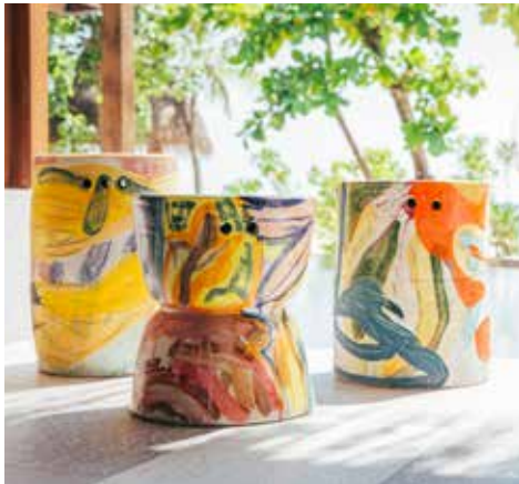
Mini Stools Location : Mura Bar

“These works at JOALI are vessels that carry my past, they now breathe the air of the MALDIVES and their surfaces will absorb the heat of this wonderful island, they will now listen to stories and befriend the guests as they age and live.”