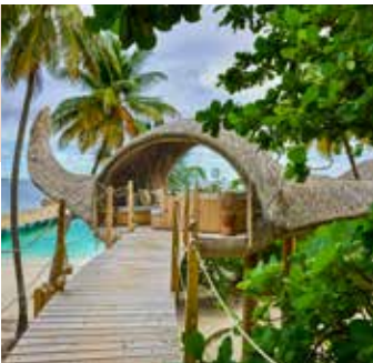
Heron Chair – KARA