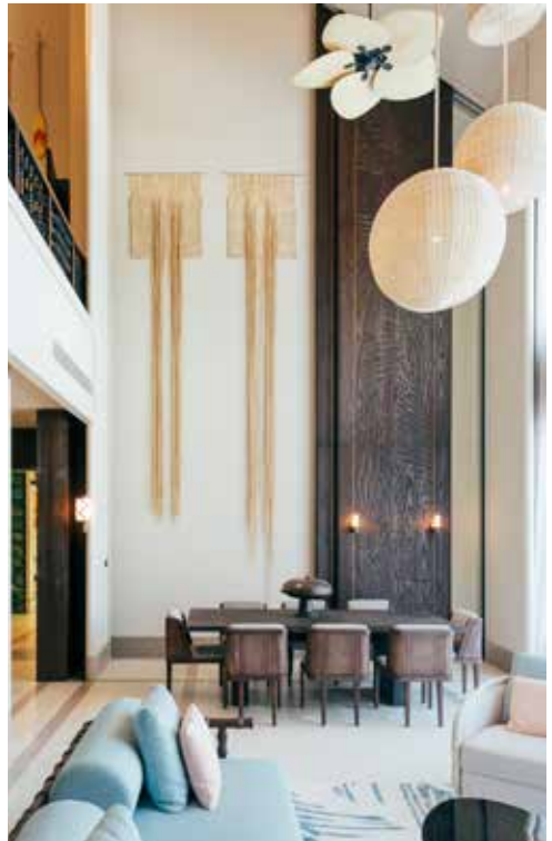
Rawness Location: Villa 6

Crafted by Kang through a meditative process, the tapestries reflect a fusion between the modern and the traditional. Note how the contemporary look contrasts with the time-honoured composition of materials.